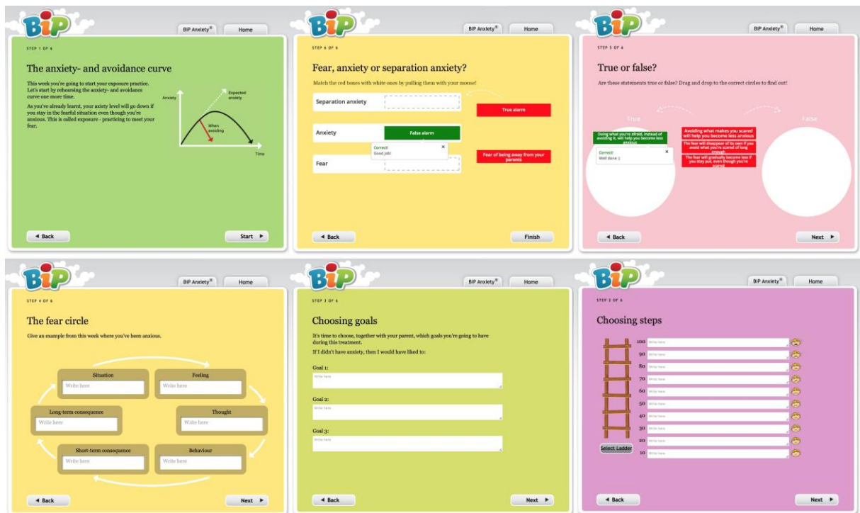
Supplemental Figure 1: Screenshots from the ICBT treatment BiP Anxiety Note. Translated from Swedish.